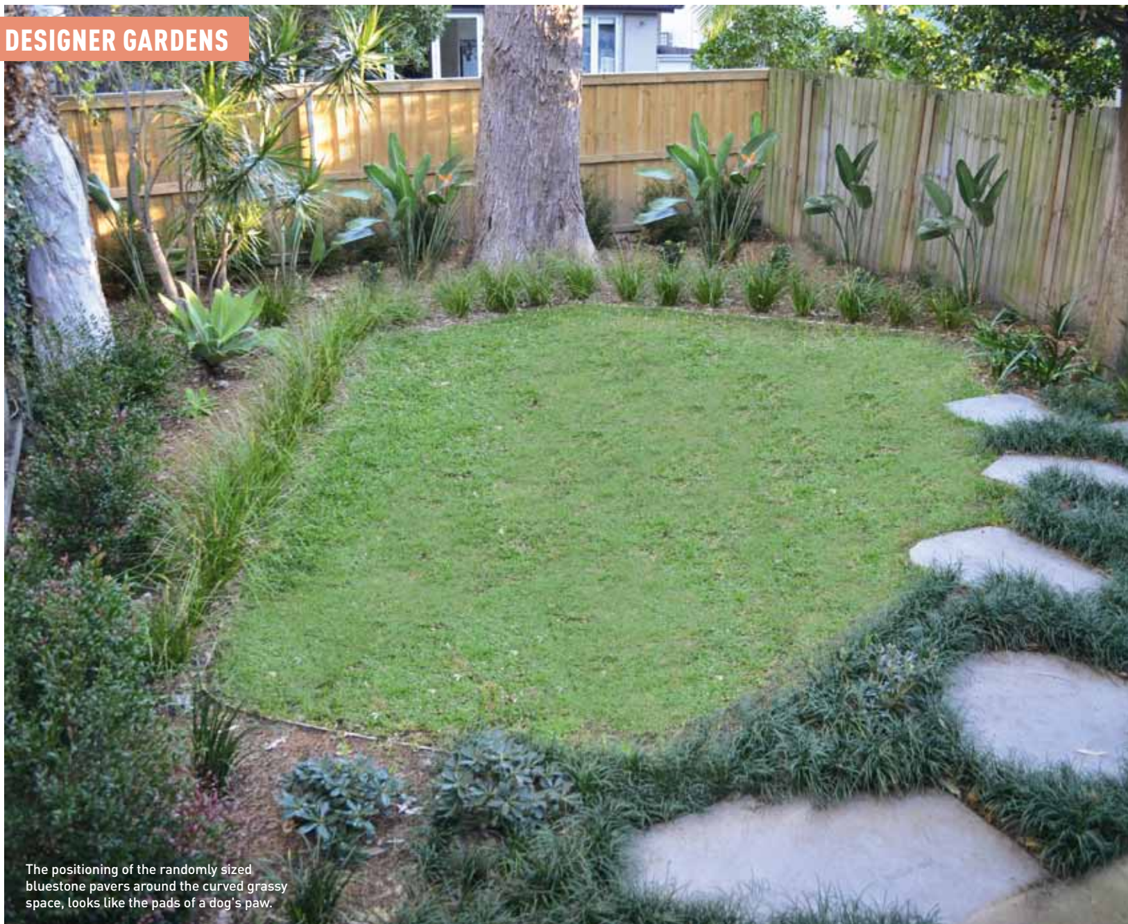
The positioning of the randomly sized bluestone pavers around the curved grassy space, looks like the pads of a dog's paw.

The key eco-friendly elements are the soft landscaping elements. The plants used are all drought-tolerant, so require minimal watering. The natives are low-maintenance, and select groundcovers and screening plants have been chosen that spread quickly, working well with the existing site and soil conditions.