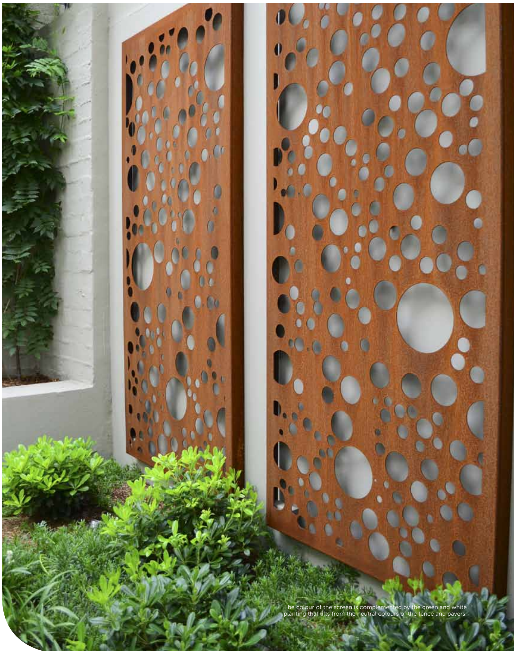
The colour of the screen is complemented by the green and white planting that lifts from the neutral colours of the fence and pavers.