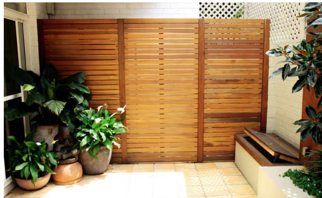
TOP A timber batten screen was installed to hide the utility area and the same material was used for all seating tops, which also have additional storage underneath.