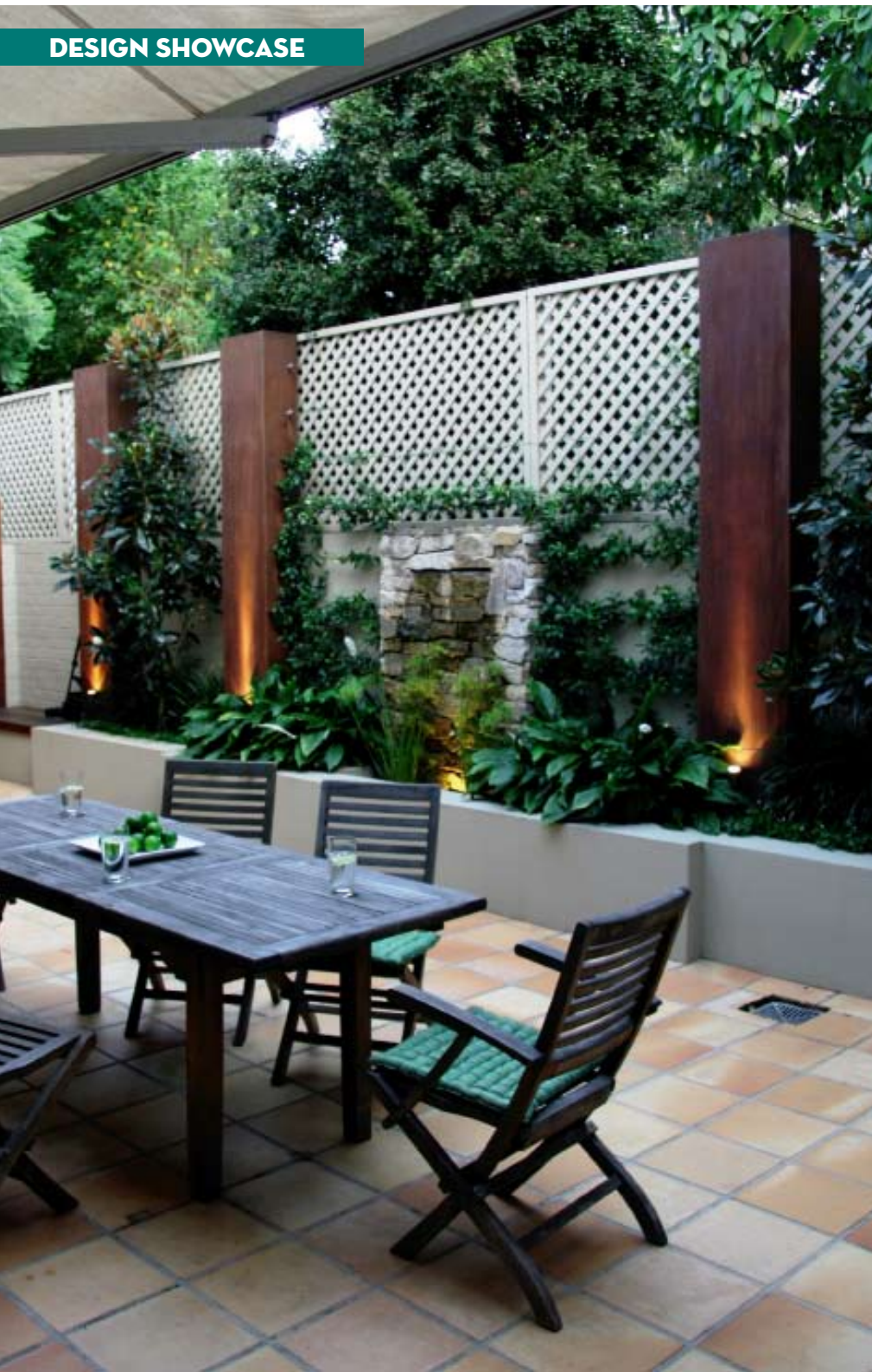
TOP Uplights were installed on the columns to highlight the space and a pond light installed for the water feature.