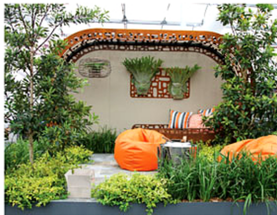
Outhouse Designs - a modern courtyard called the 'Urban Nest'

Over the next four issues of Hort Journal Australia we will showcase each of the four show gardens, explaining why the designers got involved, what the design process was like, why they chose the planting palettes and how they found the experience.