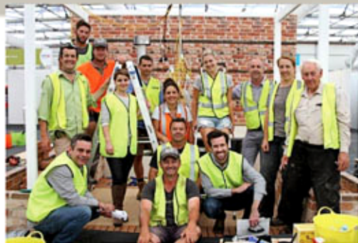
The teams benefitted from working together

With only 12 hours to go before the grand opening, all the designers were finalising their own designs and checking with everyone else to ensure they were on track and happy with their progress. There was no competitive streak or attitude shown to each other, everyone offered genuine thought, care and concern. This, in my mind, is something all involved should be proud of.