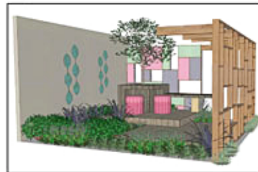
Glenice Buck - 'Pollination'