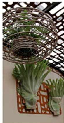
Detail - 'Urban Nest'