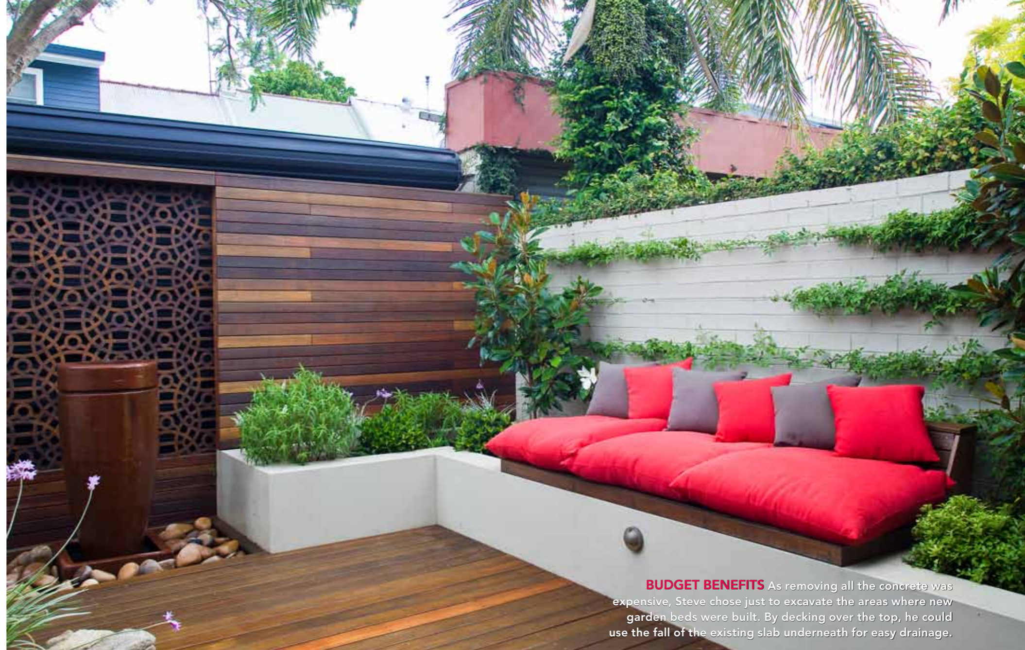
BUDGET BENEFITS As removing all the concrete was expensive, Steve chose just to excavate the areas where new garden beds were built. By decking over the top, he could use the fall of the existing slab underneath for easy drainage.

The first step was to level the ground plane and make a smooth floor that joins the dining room with the garden. By using decking over the existing concrete surface, Steve could direct drainage away from the house so there was no need for a step as you walk through the sliding glass doors.