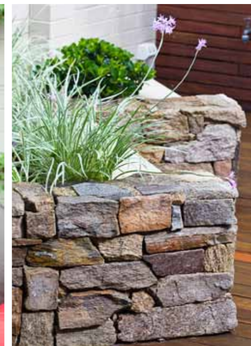
ABOVE: the colour scheme is a clever blend of neutrals, earthy timber tones that blend with the rusty fountain, plus Clare's inspired choice of red cushions. NEAR LEFT: dry stone walling is from Eco Outdoor in the alpine style – www.ecooutdoor.com.au CENTRE LEFT: the owner, Clare, now has the space she wanted; she can take it easy here after work, or invite friends around for a memorable backyard party. OPPOSITE, BELOW: the deck effectively extends the dining room outdoors, without changing levels.